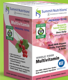
Prenatal Total Multivitamin # 186520

All our Multivitamins are NSF certified for content tested and organic wholefood based