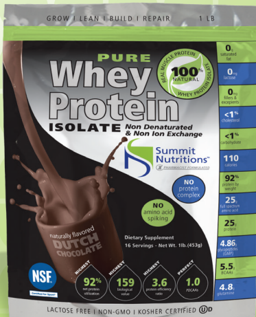
NSF Certified Sports Pure Whey Protein Isolate CHO # 186527, VAN # 186525