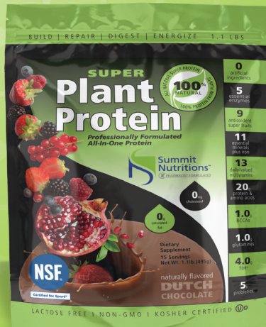
NSF Certified Sports Super Organic Plant Protein CHO # 186528, VAN #