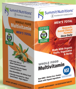
Men's Total Multivitamin # 186433