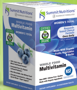
Women's Total Multivitamin # 186432