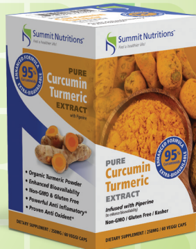
Pure Curcumin Turmeric Extract # 186522