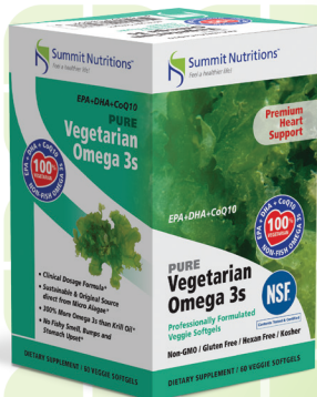
NSF Certified Pure Vegetarian Omega 3s - EPA+DHA+CoQ10 # 186431