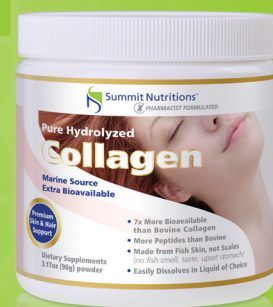
Pure Hydrolyzed Marine Collagen # 186523